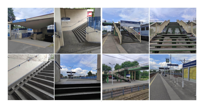
Fig. 1. The main railway station in Bielsko-Biała –access to the platform, the shed, and the footbridge (the authors' photography)

If a person in a wheelchair is at the railway station in Bielsko-Biała (Figs. 1 and 2) for the first time, they will not know that the previous effort put in to overcome two steps is not needed because the exit to the tunnel is not possible anyway. The authors of this article analyzed all the disadvantages of the driveway in turn: