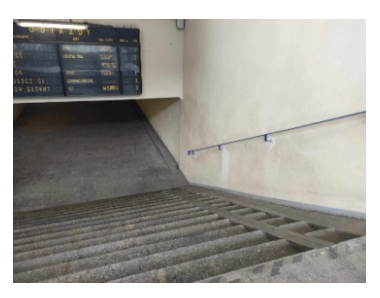
Fig. 2. Stairs and driveway in the tunnel at the main railway station in Bielsko-Biała

The Regulation of the Minister of Infrastructure dated April 12, 2002, regarding the technical conditions that buildings and their locations should meet, Section 70 [21], constitutes a significant component in the analysis of technical conditions concerning the gradient of ramps in tunnels. This regulation provides comprehensive guidelines regarding the permissible range of gradients that can be applied in the design and construction of tunnels. Pertinent information on these criteria can be found in Table 8, which illustrates the recommended values for the gradient of ramps in tunnels in accordance with the aforementioned regulation, thereby providing a foundation for further analysis in the areas of design and infrastructure safety.