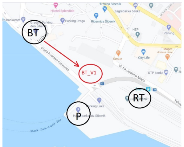
Fig. 2. Variant 1of a transport solution of the integration point in Šibenik

The first variant entails relocating the bus terminal to a location next to the port as shown in Fig. 2. The railway terminal would be located at a higher sea level. The port would have an independent passenger maritime terminal that would be a ticket vendor and distributor of accompanying services. The bus terminal would be at a lower sea level and would also have the same kind of facilities. The railway terminal on the upper level would be connected to the lower level via a staircase or escalator placed right next to the bus terminal. The passenger terminal would be located at the same place it is today. The lower level would have a taxi rank, rent-a-car and cycling facilities, and park & ride and kiss & ride systems.