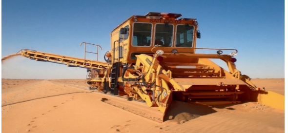
Fig. 1. Sandy drift of a railway track near the station Altynkol (Kazakhstan)