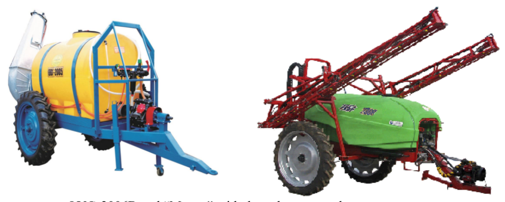
Fig. 3. Side blast sprayers: OVG-2006B and "Master" with drop-down consoles

The essence of PhChM is to implement a technological method of spraying a binder on a fixed sand surface with garden sprayers (Fig. 3).