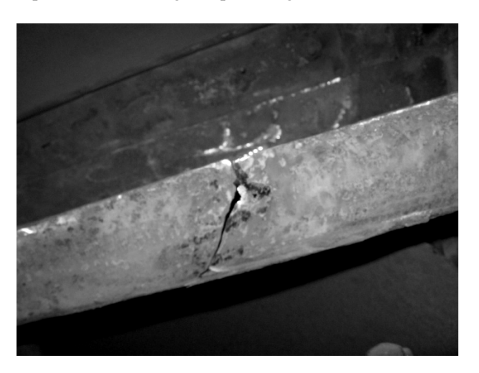
Fig. 1. Typical fatigue cracking in trucks' vehicle frame

structures of weld metal deposit with the composition 0.08% C, 0.8% Mn, 400 ppm O and 2% Ni or 0.4% Mo could be considered optimal because it corresponds with a high percentage of acicular ferrite AF (until 55%) that corresponds with the high-impact toughness of welds [12-13].