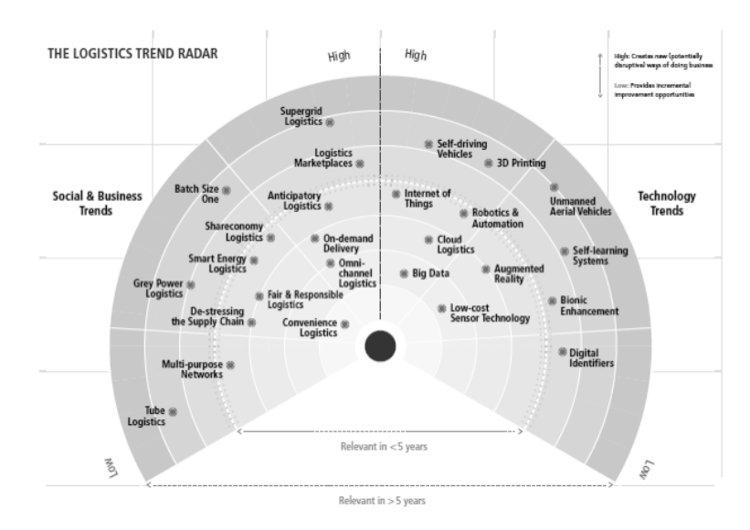
Fig. 3. Logistics Trend Radar

One of the leading worldwide logistics providers, DHL, represents practically the same forecasting information in the field of IoT and UV, additionally including tube logistics and other cutting-edge elements and viewing other forecast horizons [17] (Fig. 3).