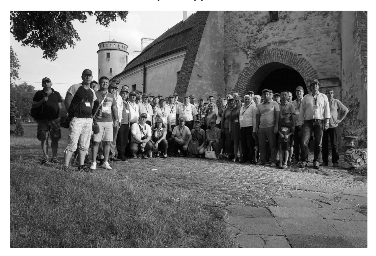
Fig. 2. Participants of the 9th Conference "Transport Problems" near the 12th century monastery, in which meetings were held

issues in which articles of participants in research conferences, symposiums, etc. are published. Special editions are published irregularly. Requirements for articles in these publications are as high as for articles in regular issues. For example, in 2014, the issue of the journal (special edition) dedicated to the RailNewcastle Summer School was published [3].