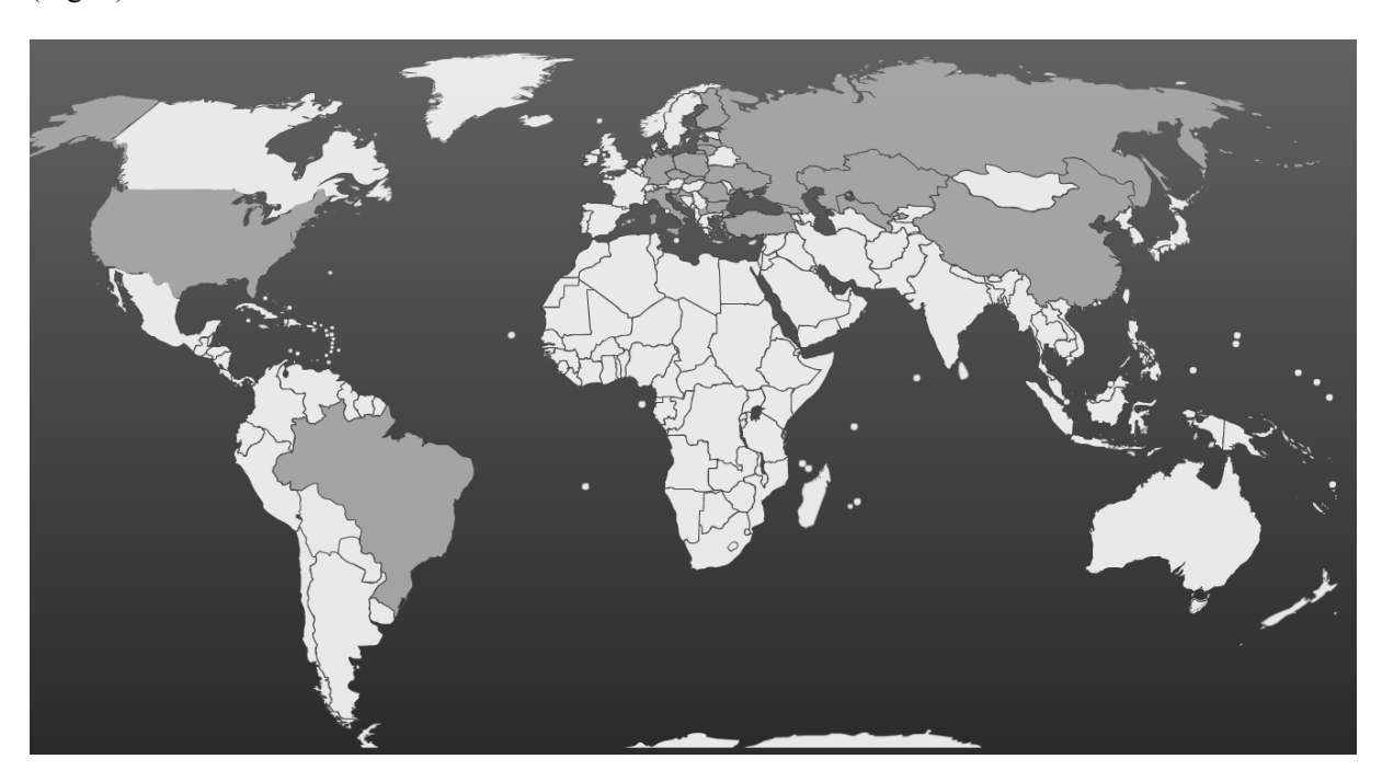
Fig. 1. Geography of the conference "Transport Problems" in 2017

meetings are held in various interesting places in Southern Poland. Thus, besides the exchange of scientific information, the participants of the conference can get acquainted with the rich history and culture of the Polish people. For example, the main part of the last ninth conference was held in the city of Sulejów in a hotel, which is located on the territory of the monastery of the 12th century (Fig. 2).