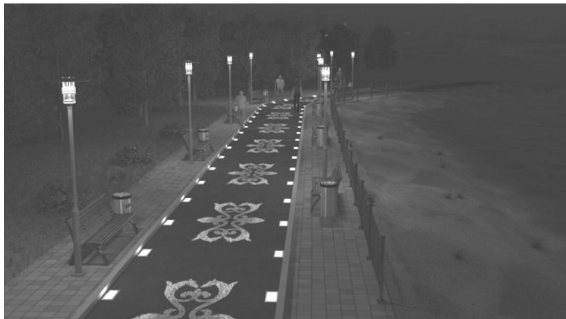
Fig. 6. The construction variant of illuminated bicycle road in Almaty and Astana cities

Taking into consideration the experience of the Netherlands it will be interesting to set up illuminated bicycle roads with national decorative patterns in Almaty and Astana for familiarizing visitors, tourists and local people with the culture, art, and traditions of the Kazakh people. An example of such a bicycle road is presented in Fig. 6 [23, 143].