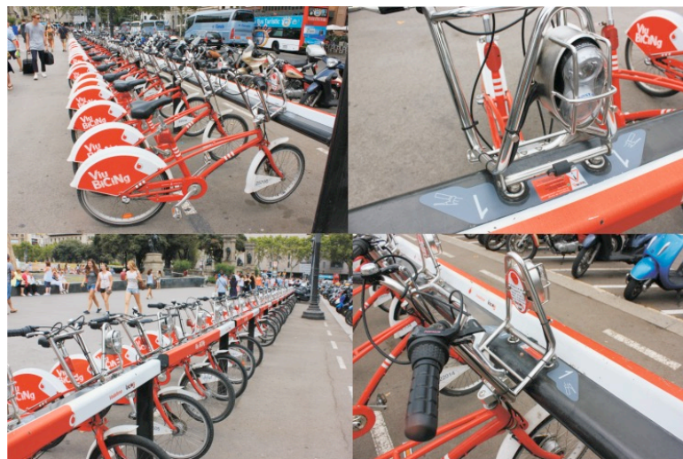
Fig. 2. A typical bicycle parking of the “Bicing” system (Near the Spain square, as well as the Ramblas Street)

After registering oneself on the city’s cycling system for a nominal monthly fee of 24 euros a year (during the promotions an annual pass could be bought for as low as 6 EUR), the participant receives their card by post, which gives them the right to an unlimited number of cycling trips. The cost of this annual card is lower than the total cost of four T10 cards (using a T10 card one can make 10 trips on public transport in Barcelona), and the sum of these four cards is insufficient for daily use throughout the month.