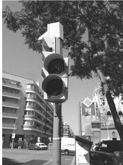
Fig. 4. The bicycle path with a dedicated traffic light in Barcelona (Near the world-famous monument of Antoni Gaudí “Sagrada Familia”).

It is also important to note that there are well-developed bicycle infrastructure, traffic lights, and traffic signs strictly reserved for bicyclists in Barcelona. Fig. 4 illustrates a typical bicycle path with a dedicated traffic light [18; 1080–1082].