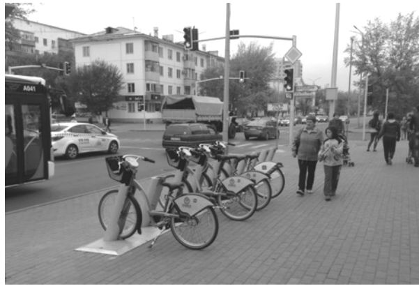
Fig. 5. Bicycle parking places of “Astana Bike” system on the Yesenberlin Street

A master plan for the development of the main city guarantees the development of proper infrastructure for bicyclists. The number of amateur bicyclists among Astana citizens increases every year. Some of the citizens cycle for fitness and health; others cycle for leisure; and for some the bicycle is a means of transport.