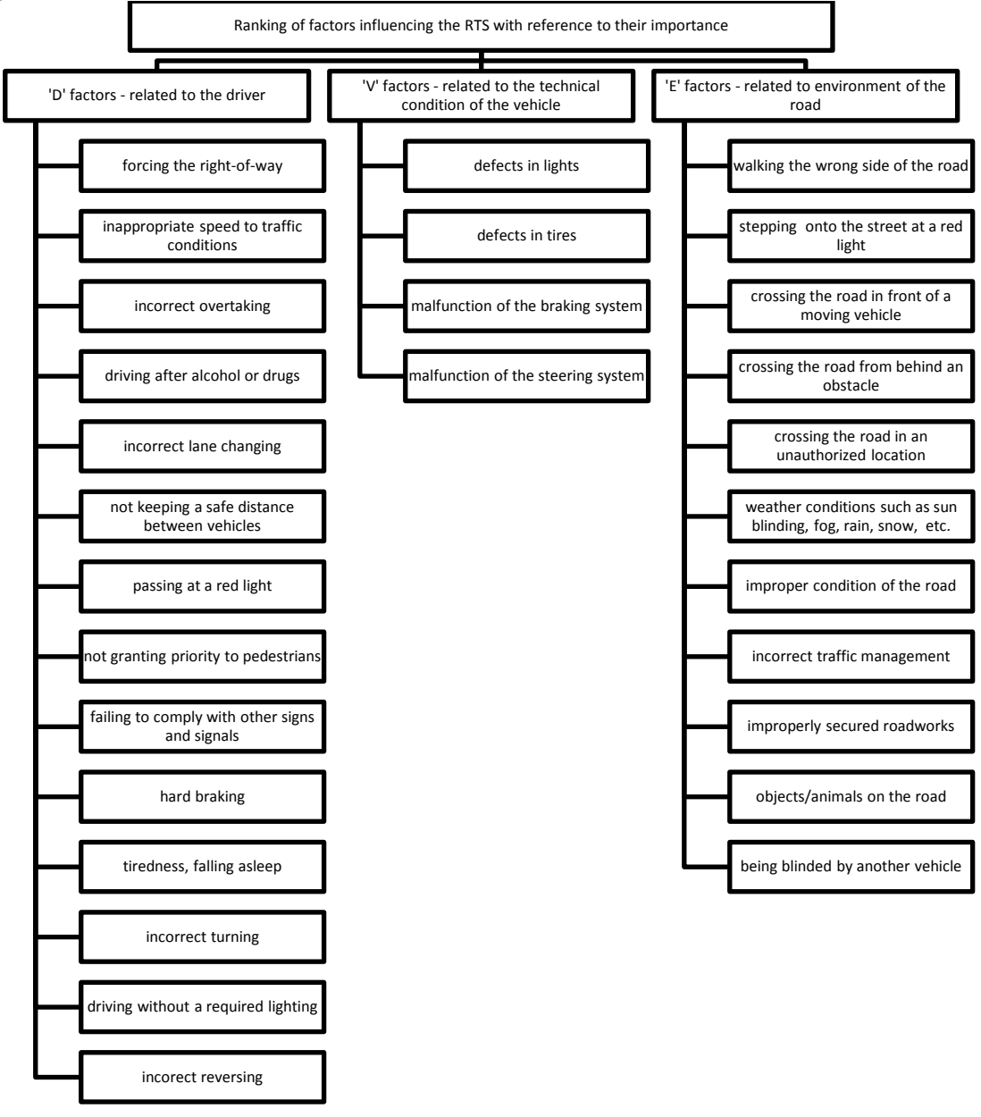
Fig. 2. Scheme of decomposition of ranking factors influencing the RTS referring to their importance Rys. 2. Schemat dekompozycji zadania szeregowania czynników wpływających na stan BRD w odniesieniu do ich istotności

The general form of a hierarchical structure, representing the issue discussed in the paper, is shown in Fig. 2.