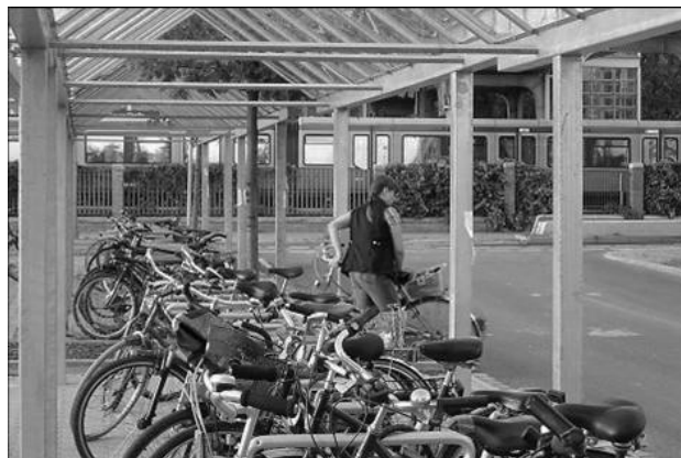
Fig. 2. Bike & Ride parking at one of a public transport stops in Berlin