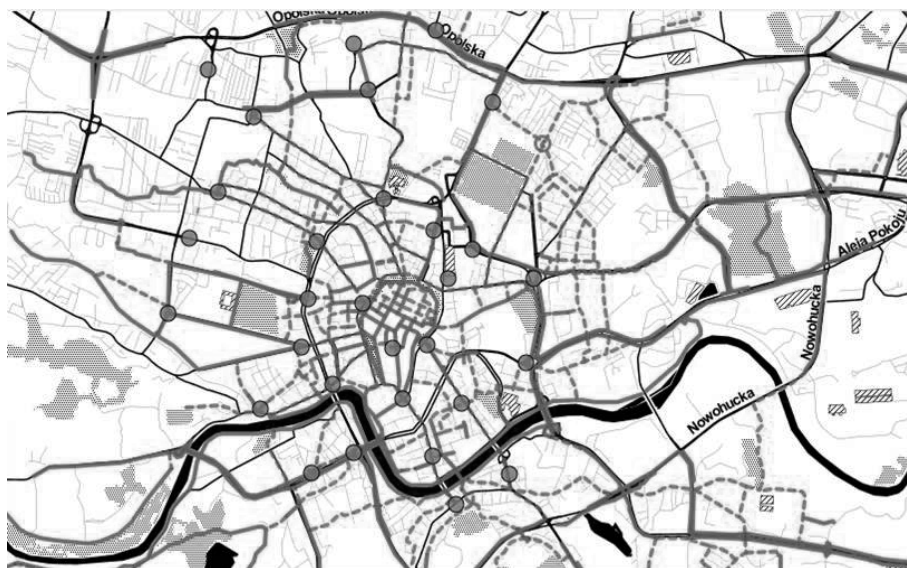
Fig. 3. Location of the stations of public bikes in Cracow.

Since the creation of the system, the city planned to expand the city bike offer to all the city area. During several years of the functioning of the system, the number of stations was subsequently increased as well as the number of bicycles available in bike rental system. In season 2014, 30 stations and 270 bicycles were facilitated. Fig. 3 shows the location of stations (grey spots).