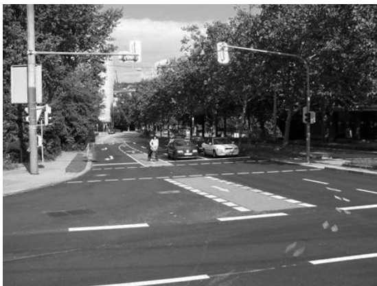
Fig. 1. Safe solution for bike traffic through an intersection in Stuttgart

Figures 1 and 2 show examples of good practices in terms of investment instruments used abroad.