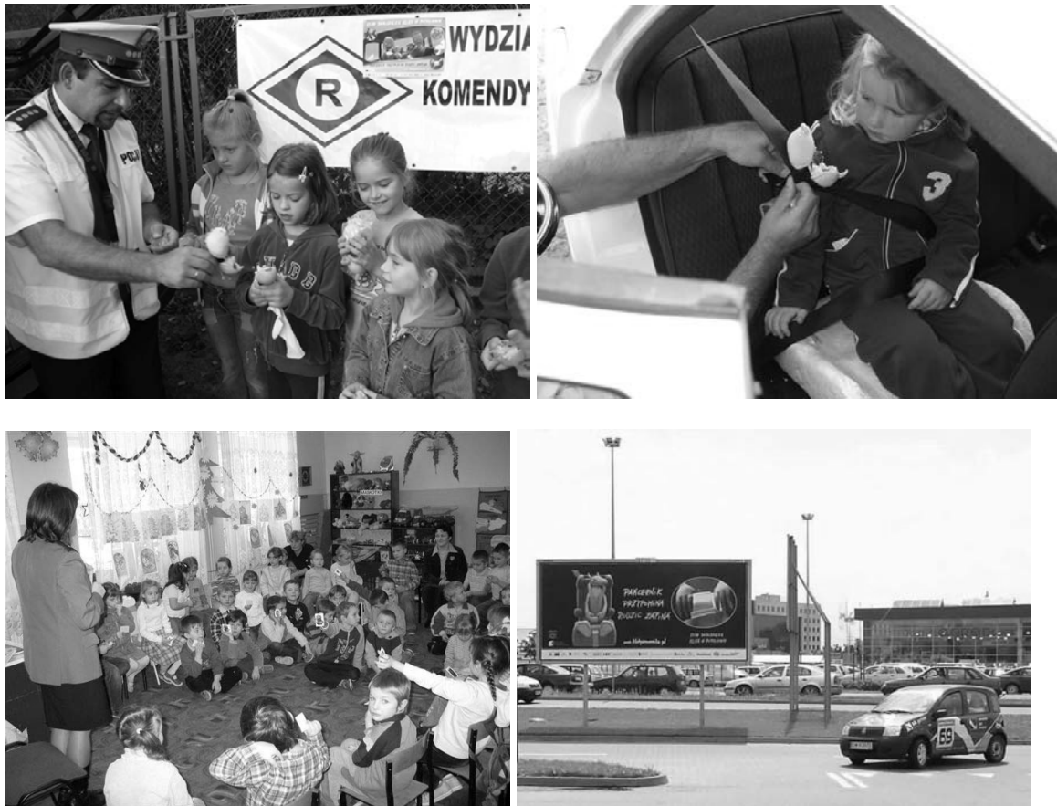
Fig. 1. Action and initiatives on campaign “Armadillo Club Always Belt Up”

The pre-tests: the quantitative opinion polls were carried out on the representative group of parents and their children aged 4-12 (small groups of parents, children and individual interviews with children).