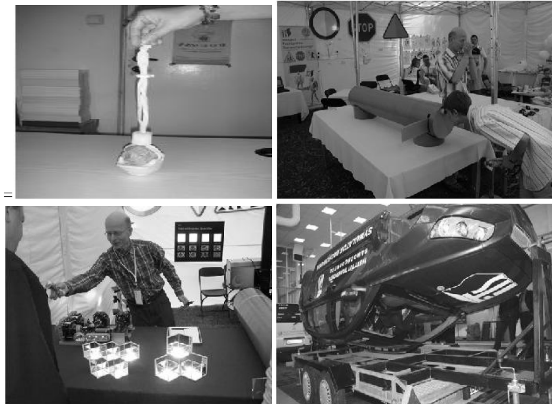
Fig. 4. Mobile nest demonstrations at different events across country

Another type of nest developed at MTI according to the AVENUE project was a Mobile. Its equipment: the roll-over car simulator, belt-sledges, alco-goggles, visibility and helmets simulations were highly appreciated and widely used by different road users during various events, picnics, happenings promoting road safety across the whole country such as: Road Safety Days, Safe on bike, Finale of the Great Orchestra of Christmas Charity, Safe Driver Day, preventive police campaign "Safer on the bicycle", the campaign "By bike safely to your destination", Science picnic of Polish Radio and the Copernicus Science Centre. The equipment of Mobile nest and the qualified staff of Road Traffic Safety Department help teachers and instructors schools on RSE subject.