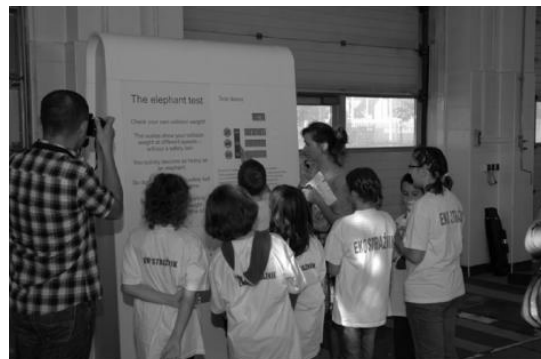
Fig. 3. Participants of the National NEST at MTI

Rys. 3. Uczestnicy szkoleń w Krajowym Miasteczku Bezpieczeństwa Ruchu Drogowego