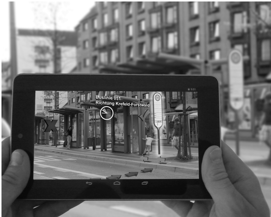
Fig. 2. Augmented Reality mock up highlighting proper bus station in the city of Krefeld Rys. 2. Rozwiązanie mobilne podkreślające właściwy dworzec autobusowy w mieście Krefeld

connected to. At the moment we are implementing a user interface that directly overlays a camera's view with relevant information as shown in the mock-up picture in figure 2.