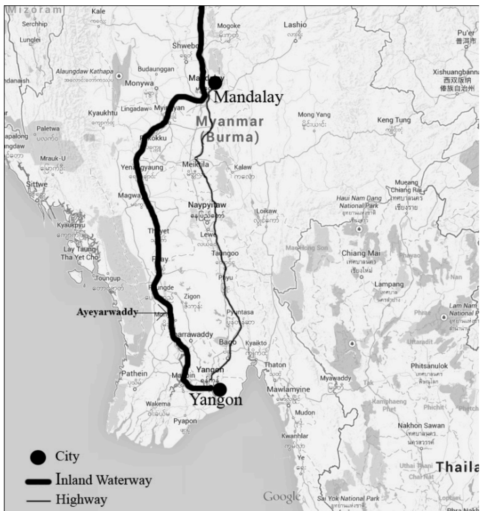
Fig. 1. Major river transport and road transport network linking Mandalay and Yangon