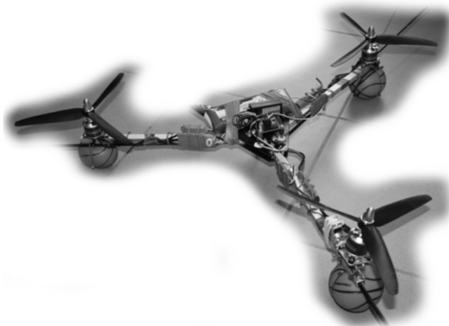
Fig. 1. A multirotor aerial vehicle with three propellers as control object

MAV must be stable in order to execute any task, whether it is hovering or maneuver. Thus, an angular stabilisation system, providing roll, pitch and yaw angles constancy, is necessary. Task of this work is to create such angular stabilisation system, which satisfies all requirements of technical task.