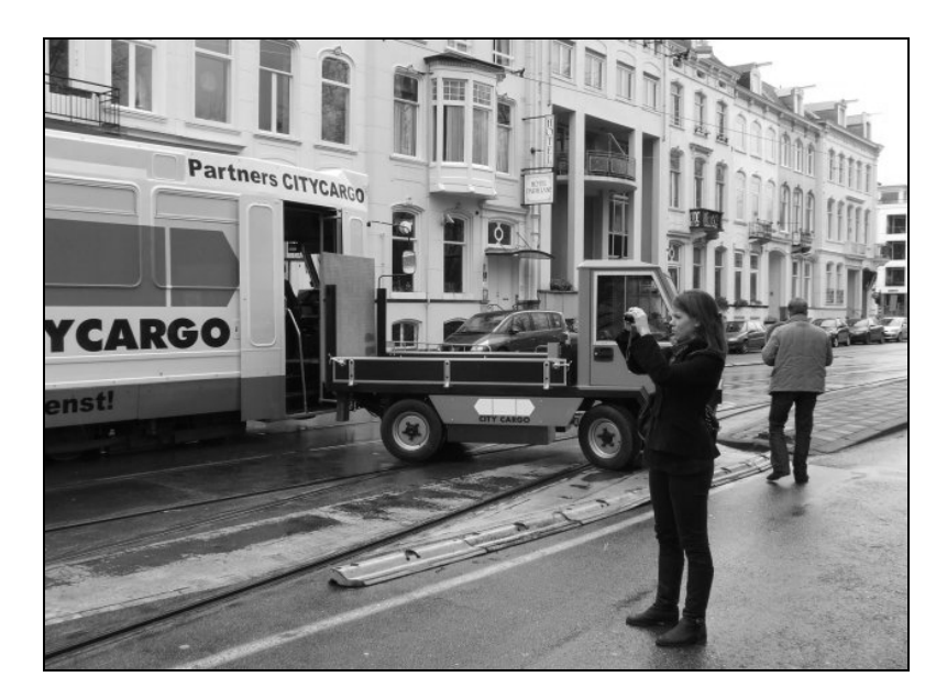
Fig. 1. CityCargo Tram in Amsterdam Рис. 1. Городской грузовой трамвай в Амстердаме

The operation pattern of CityCargo was: The freight to be transported was received in warehouses on the outskirts of Amsterdam, where freight was shipped in CityCargo trams. CityCargo trams took freight to locations inside Amsterdam. They were using alternative routes on the existing tram network of Amsterdam. , The routes of CityCargo trams were not explicitly fixed. Instead, the routes were specified according to demands, congestions, peaks and off-peaks. By using different routes, the CityCargo trams did not intervene with the passenger tram services. After arriving at the desired location deep inside the city of Amsterdam, the freight from the CityCargo trams was moved to "Green" Vehicles (also called E-Cars, see Fig. 1 [15]). These Green Vehicles then transported the freight to the final customer.