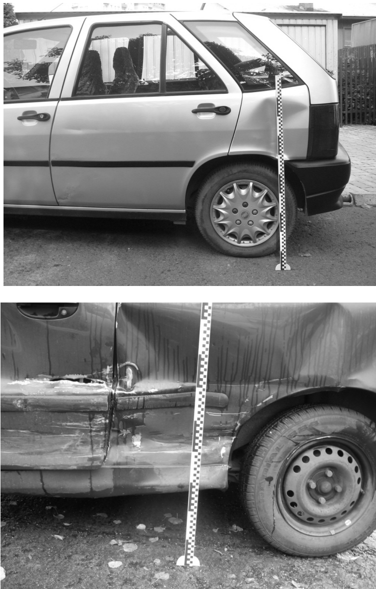
Fig. 1. The example photo documentation of the vehicle damage Rys. 1. Przykładowa dokumentacja zdjęciowa uszkodzeń pojazdu