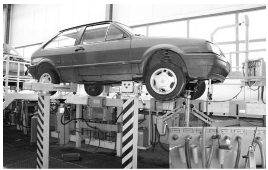
Fig. 2. Industrial line method of vehicle dismantling [9] Rys. 2. Metoda potokowa demontażu pojazdów

The industrial line method is similar to production line. The capacity is high and it is analogical to production in the reverse direction (fig. 2). This process requires fluency of dismantling and high productivity.