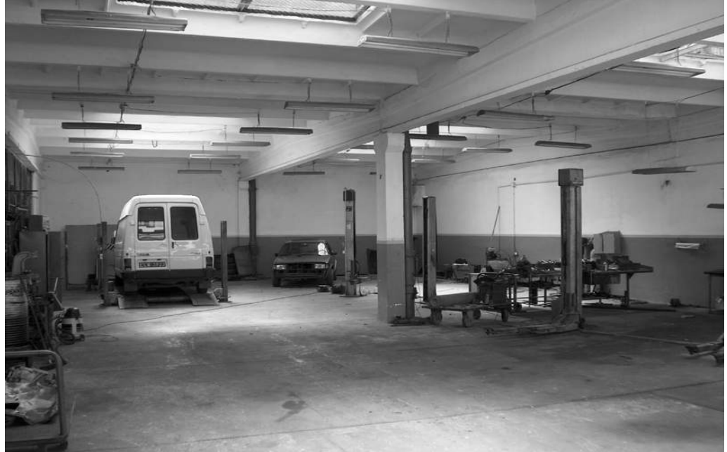
Fig. 4. Work centre dismantling method [9] Rys. 4. Stanowiskowa metoda demontażu pojazdów

Dismantling work centre method - in that method a group of workers dismantle parts and assemblies for regeneration, further use or for recycling (fig. 4). Each type of car assembly is separated and segregated and put to individual container and then it is transported to warehouse or recycling station. Each stand is equipped with car lift with pneumatic tools for disassembly. Further disassembly is made on work benches.