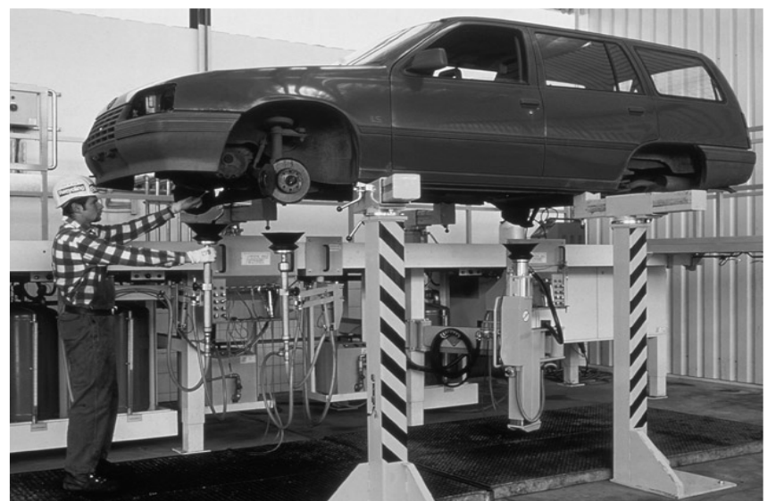
Fig. 3. Drainage of fluids from the vehicle [9] Rys. 3. Usuwanie płynów z pojazdu