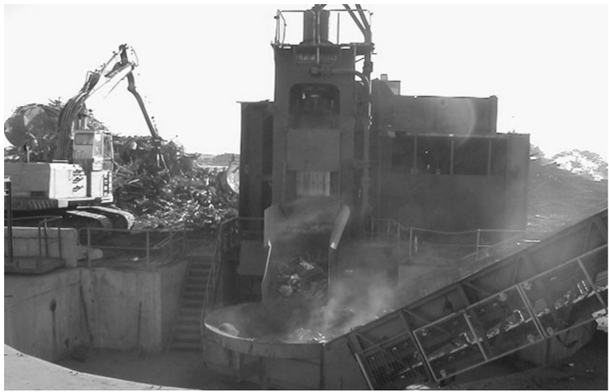
Fig. 5. Metal shredder [10] Rys. 5. Strzępiarka samochodowa

The most profitable is regeneration of parts and selling of engine subassemblies (or even entire engines), body and chassis assemblies. All parts that could be used again after refurbishing can be sold directly to other users. All remaining like: chassis or body is kept on storage yards on special racks. Then they are transported to shredders (fig. 5). Typically shredding of one vehicle (with average mass 600 kg) takes 20 seconds. Then different segregation methods are used for selecting material by different physical properties. It is made in pneumatic and magnetic segregation. Some of remainings can be recycled as fuel in cement plants or ironworks.