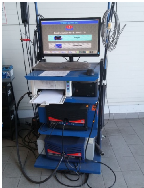
Fig. 3. Opacimeter