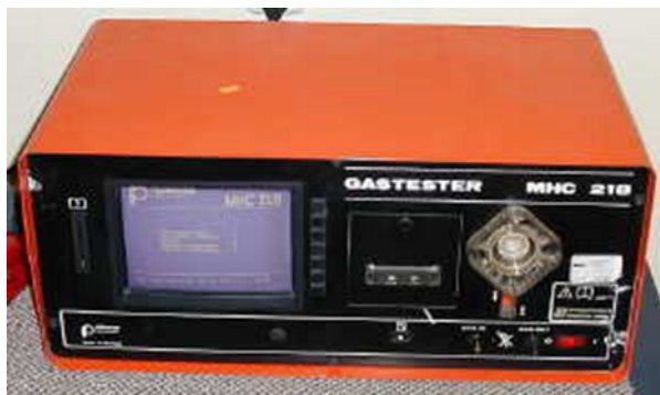
Fig. 4. Hermann exhaust gas analyser MHC 218

Another group of means of transport dedicated to research are passenger cars, whose exhaust gases also negatively affect human health. The Hermann MHC 218 type NDIR flue gas analyzer was used for the test (Fig. 4), which uses the phenomenon of infrared radiation absorption. It is intended for spark-ignition vehicles.