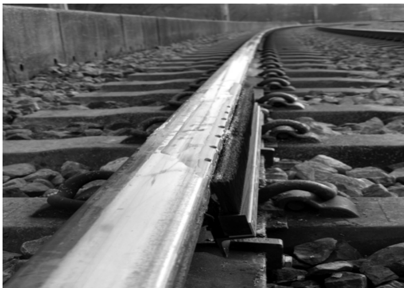
Fig. 1. Dosing borings of CL-E1 top anti noise system Bild 1. Bohrungen des CL-E1 Anti-Lärm-Systems

CL-E1 top anti noise system with patented boreholes offers reasonable noise reduction despite extremely low consumption of CHFC material. The whole system can be installed also in the middle of the curve and underground. CL-E1 provides also reduction of rails and wheel life cycle cost. CL-E1 reduces environmental pollution with metal filings. Our measurement showed reduction from 2218 kg to 779 kg per year on the curve with radius r = 400\text{ m} and length l = 60\text{ m} .