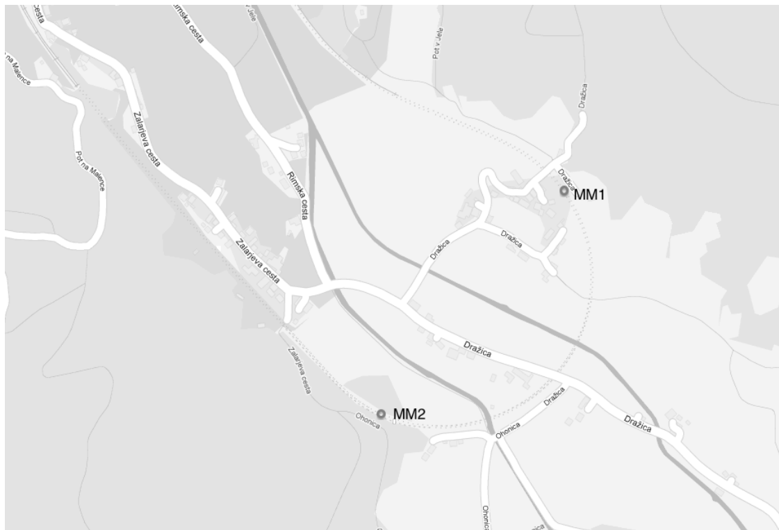
Fig. 2. Measurements points Bild 2. Messpunkte

After several measurements we gained the following results. In the Table 3 we see the average sound levels measured at two measurement points MM1 and MM2. We have average values for passenger and freight trains without and with usage of CL-E1 top anti noise system in [dB]. In the last two columns we see the average sound level reductions for passenger and freight trains respectively.