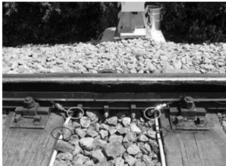
Fig. 4. CL-E1 device detects the train (a) and apply CHFC material with use of dosing element (b) directly to the desired location in the optimal concentration