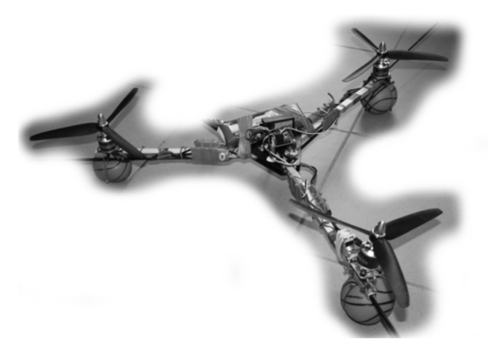
Fig. 1. A multirotor aerial vehicle with three propellers as control object Puc. 1. Мультироторный летательный аппарат с тремя винтами как объект управления

MAV must be stable in order to execute any task, whether it is hovering or maneuver. Thus, an angular stabilisation system, providing roll, pitch and yaw angles constancy, is necessary. Task of this work is to create such angular stabilisation system, which satisfies all requirements of technical task.