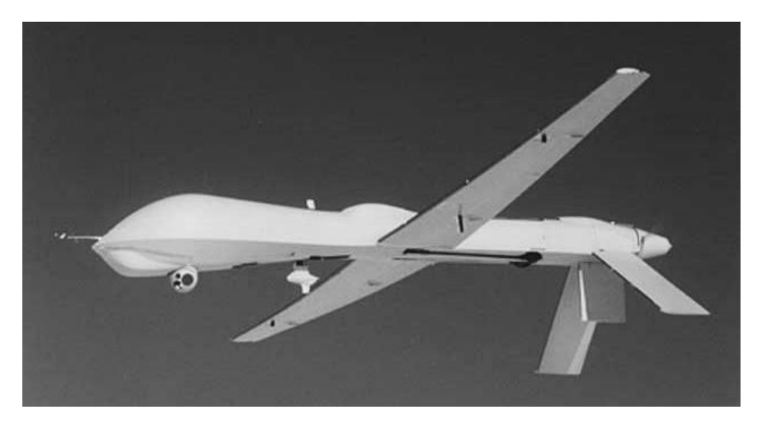
Fig. 3. MALE UAS – "RQ/MQ-1 Predator" Rys 3. BSP klasy MALE – "RQ/MQ-1 Predator"

Launch & Recovery System (LRS) – Conventional wheeled, Take-off – 1530 m, Landing – 920 m, 5 people L&R team required, one GCS can control up to four UAVs but one operator can control only one UAV. Analysis Equipment consist of three Boeing Data Exploitation and Mission Planning Consoles and two SAR (Synthetic Aperture Radar) workstations. Every Predator system consists of four UAVs, a ground control station, and a satellite communications terminal. Required distance of the runway is 1530 m, Wing span-14.8 m, Weight-1043 kg, Lenght-8.2 m, Cruise speed-120 knots, Max ceiling- 25 000 ft, Max endurance-40 h, Max payload-204/136 kg (internal/external) [14].