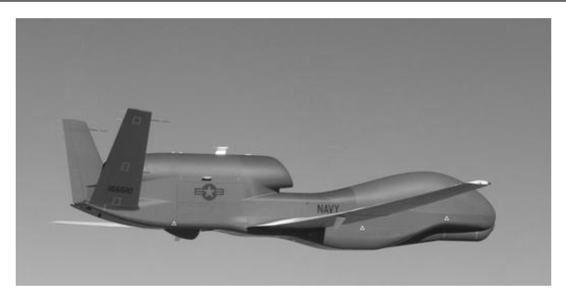
Fig. 2. HALE UAS – "Global Hawk" Rys. 2. BSP klasy HALE – "Global Hawk"