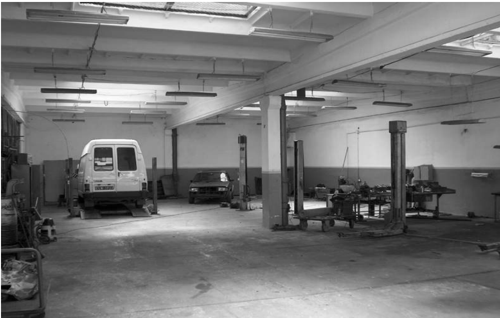
Fig. 4. Work centre dismantling method [9]

Dismantling work centre method - in that method a group of workers dismantle parts and assemblies for regeneration, further use or for recycling (fig. 4). Each type of car assembly is separated and segregated and put to individual container and then it is transported to warehouse or recycling station. Each stand is equipped with car lift with pneumatic tools for disassembly. Further disassembly is made on work benches.